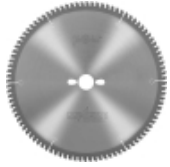
series for miter saws