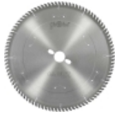
Saw blades LL CUT VH line 3GS for batch cutting frames and natural veneer materials